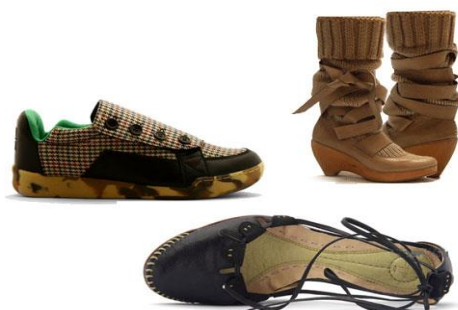
Figure 2: Terra plana eco-friendly shoes [7]

Despite the stereotypes, “eco-friendly footwear” doesn’t have to mean hemp sandals or Birkenstocks. British shoe company Terra Plana has been putting its own unique stamp on eco-friendly style since 2001, with their quirky shoes made from environmentally sustainable materials like recycled rubber, vegetable tanned leathers, and recycled Pakistani quilts [7].